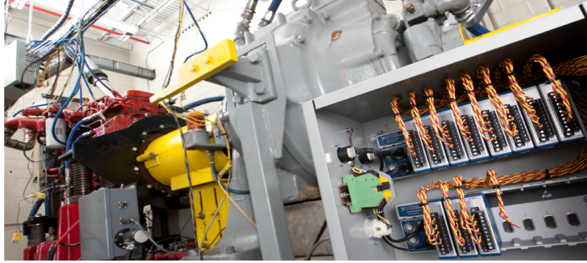
Figure 2. Spend less time preparing instrumentation for the rigors of field testing with CompactDAQ's extended temperature range, shock and vibration resistance.