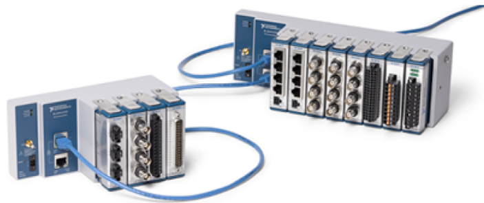
Figure 1. Easily expand your system with an integrated network switch for simple daisy chaining.

For long-distance, distributed systems, you can use a Time Sensitive Networking (TSN) enabled CompactDAQ device. TSN is the next evolution of the IEEE 802.1 Ethernet standard. It provides sub-microsecond synchronization over a distributed network of DAQ nodes. Precise timestamps and packet-based communication are used to share a common notion of time on all nodes in the network, which allows for accurate synchronization over long distances and eliminates the need for lengthy, physical timing cables.